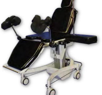
Best<sup>™</sup> Universal Chair/Table