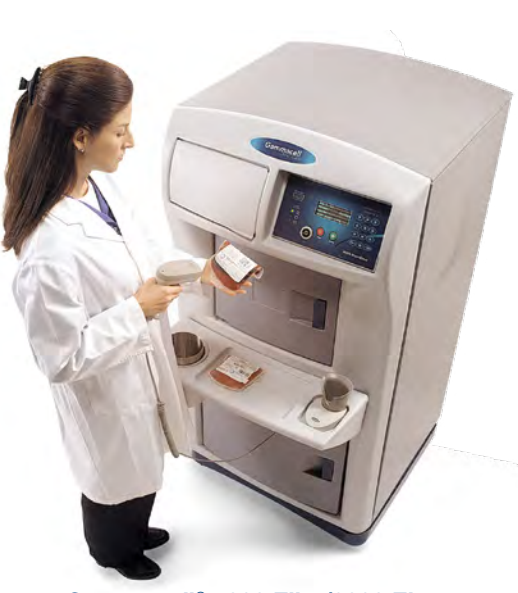
Gammacell<sup>®</sup> 1000 Elite/3000 Elan Blood & Research Irradiator