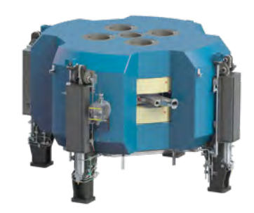
Best<sup>™</sup> B35adp Alpha/Deuteron/Proton Cyclotron for medical radioisotope production and other applications

BCS and BTL are collaborating with National Laboratories in Europe and the USA to enhance the capabilities of all the cyclotrons. These cyclotrons have external ion sources, allowing for high current cyclotron designs. The system features enable customers to significantly reduce costs for acquisition, maintenance, and operation.