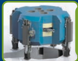
Best™ Cyclotron Systems 15, 20u/25, 30u/35 & 70 MeV