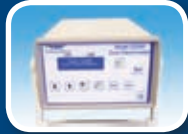
CNMC • Instruments for Medical Physics

* Certain products shown are not available for sale currently.