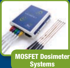
MOSFET Dosimeter Systems