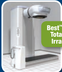
Best™ GB500 Total Body Irradiator