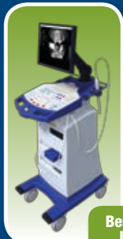
Best™ Sonalis™ Ultrasound Imaging System