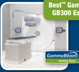
Best™ GammaBeam™ Systems GB300 Equinox & GB100-80