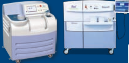
Best™ Raycell Mk1 & Mk2 Blood & Research Irradiators