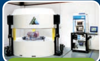
Best™ Dose On Demand™ BG-75 Biomarker Generator 7.5 MeV Cyclotron