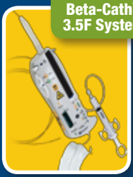
Novoste™ Beta-Cath™ 3.5F System