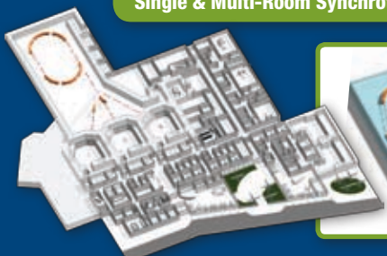
Best™ Particle Therapy Proton-to-Carbon Upgradeable Single & Multi-Room Synchrotrons