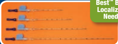
Best™ Breast Localization Needles