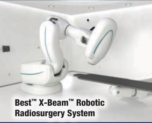
Best™ X-Beam™ Robotic Radiosurgery System