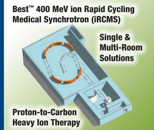
Best™ 400 MeV ion Rapid Cycling Medical Synchrotron (iRCMS)