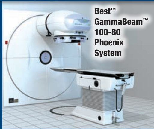
Best™ GammaBeam™ 100-80 Phoenix System