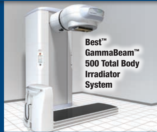
Best™ GammaBeam™ 500 Total Body Irradiator System