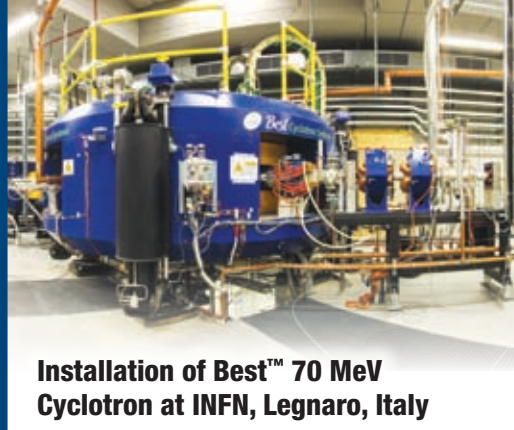
Installation of Best™ 70 MeV Cyclotron at INFN, Legnaro, Italy

Radiographic & Fluoroscopic Radiotherapy Simulation