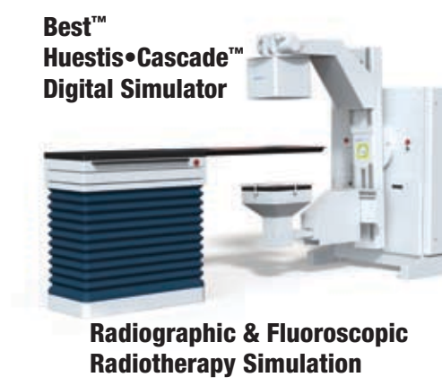
Best™ Huestis™ Cascade™ Digital Simulator

Radiographic & Fluoroscopic Radiotherapy Simulation