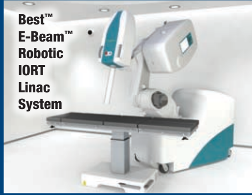
Best™ E-Beam™ Robotic IORT Linac System