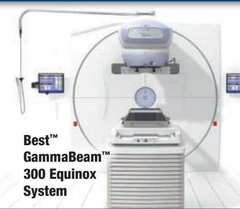
Best™ GammaBeam™ 300 Equinox System

GammaBeam™ EBRT Systems • X-Beam™ Radiosurgery • E-Beam™ IORT • X-Beam™ image-Guided Multi-Energy Linac • Huestis™ Digital Simulator • Best™ 70 MeV Cyclotron System • Best™ 400 MeV Ion Rapid Cycling Medical Synchrotron (iRCMS)