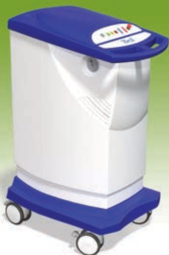
Best HDR Remote Afterloader