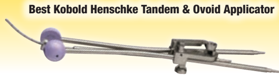
Best Kobold Henschke Tandem & Ovoid Applicator

Best Medical International, Inc. 7643 Fullerton Road, Springfield, VA 22153 USA tel: 703 451 2378 800 336 4970 www.besttotalsolutions.com www.teambest.com