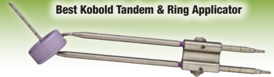
Best Kobold Tandem & Ring Applicator