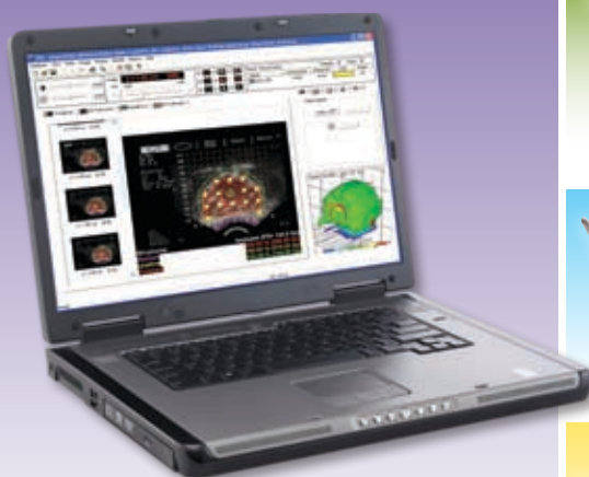
Best Treatment Planning System for LDR, HDR Brachytherapy, SRS, SBRT, Tomotherapy & Teletherapy with IMRT/IGRT