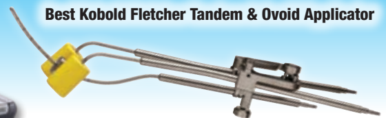
Best Kobold Fletcher Tandem & Ovoid Applicator