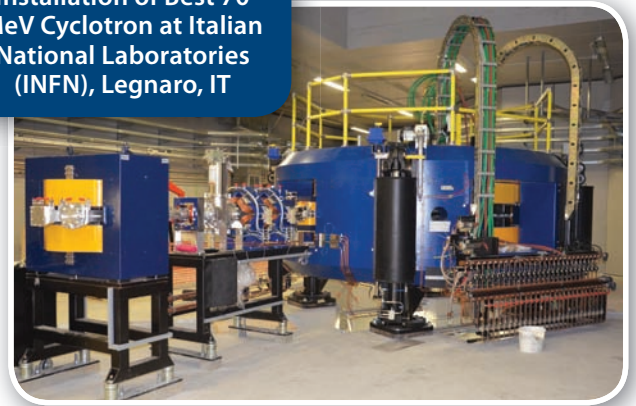
Installation of Best 70 MeV Cyclotron at Italian National Laboratories (INFN), Legnaro, IT