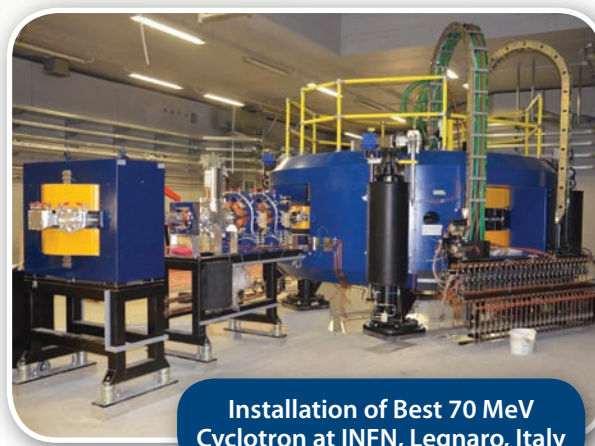
Installation of Best 70 MeV Cyclotron at INFN, Legnaro, Italy