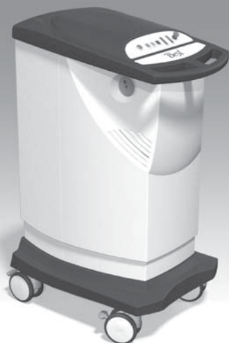
Best HDR Remote Afterloader

The new Avanza 6D table provides adjustment in all 6 dimensions, including pitch and roll. This option will greatly improve the patient set-up for all treatments.