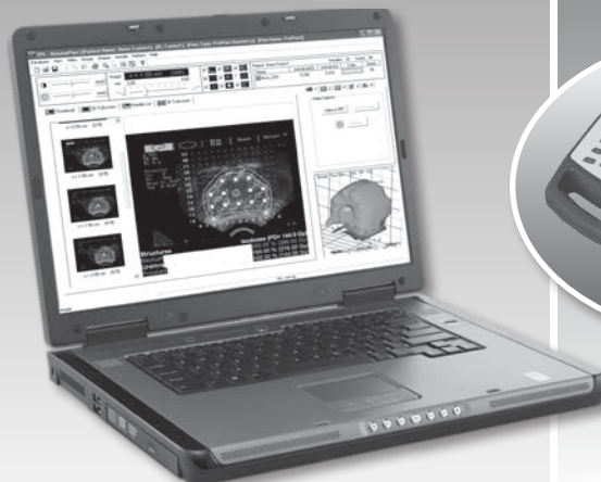
Best Treatment Planning Systems for LDR, HDR Brachytherapy, SRS, SBRT, Tomotherapy and Teletherapy with ActiveRx for IMRT