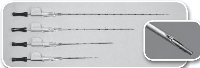
Best Flexi Needles

Available in custom lengths and diameters!