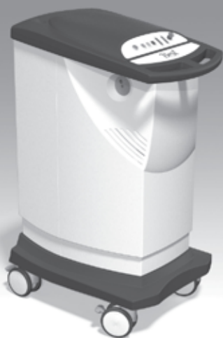
Best HDR Remote Afterloader

The new Avanza 6D table provides adjustment in all 6 dimensions, including pitch and roll. This option will greatly improve the patient set-up for all treatments.