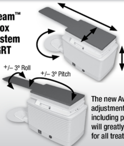
Best Avanza™ 6D Patient Positioning Table

With NEW Multi-Leaf Collimator for 80 and 100 cm SAD units — IMRT, IGRT, SRS, SBRT and Tomotherapy capable with ActiveRx