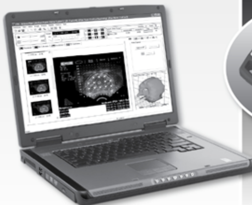
Best Treatment Planning Systems for LDR, HDR Brachytherapy, SRS, SBRT, Tomotherapy and Teletherapy with ActiveRx for IMRT