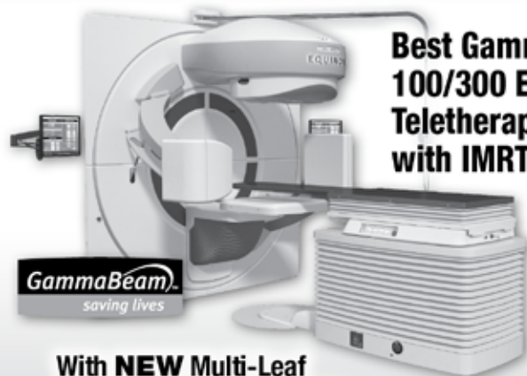
Best GammaBeam™ 100/300 Equinox Teletherapy System with IMRT & IGRT