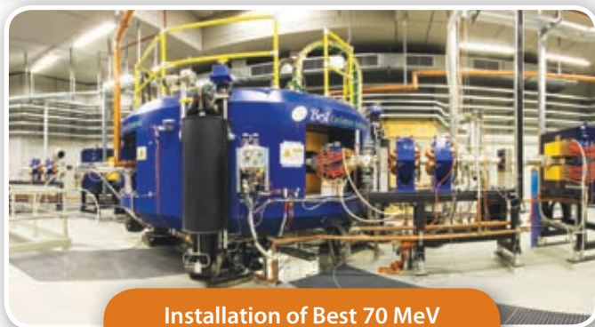
Installation of Best 70 MeV Cyclotron at INFN, Legnaro, Italy