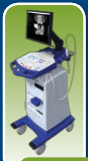
Best™ Sonalis™ Ultrasound Imaging System