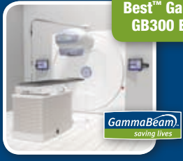
Best™ GammaBeam™ Systems GB300 Equinox & GB100-80