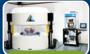
Best™ Dose On Demand™ BG-75 Biomarker Generator 7.5 MeV Cyclotron