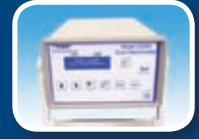
CNMC • Instruments for Medical Physics