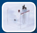
Best™ HDR Afterloader

* Certain products shown are not available for sale currently.