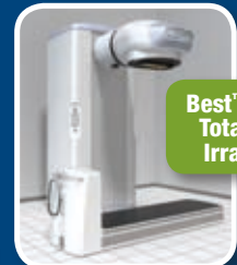
Best™ GB500 Total Body Irradiator