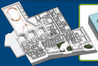
Best™ Particle Therapy Proton-to-Carbon Upgradeable Single & Multi-Room Synchrotrons