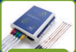
MOSFET Dosimeter Systems