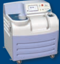
Best™ Raycell Mk1 Blood & Research Irradiator