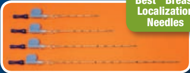
Best™ Breast Localization Needles

* Certain products shown are not available for sale currently.