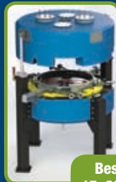
Best™ Cyclotron Systems 15, 20u/25, 30u/35 & 70 MeV