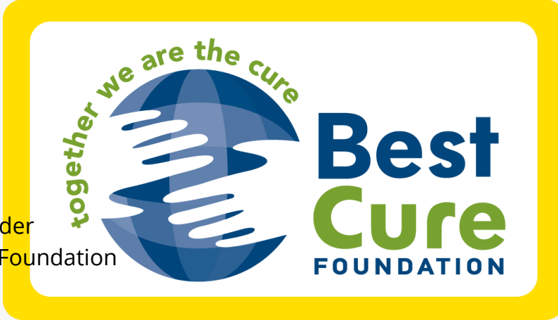
Best Cure Foundation — www.bestcure.md

This press release can be viewed online at: https://www.einpresswire.com/article/561598355