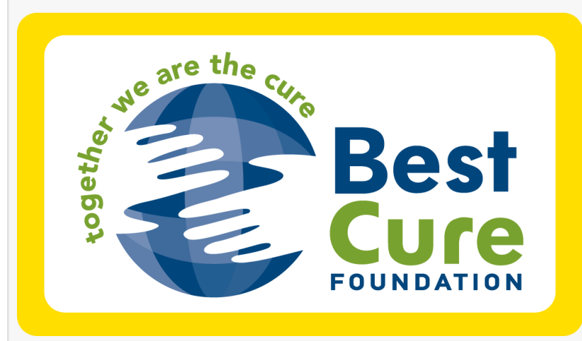
Best Cure Foundation — www.bestcure.md

For more information about <u>TeamBest Global Companies</u>, <u>Best Cyclotron Systems</u>, <u>Best ABT Molecular Imaging</u>, Best NOMOS and Best Cure Foundation, please visit: