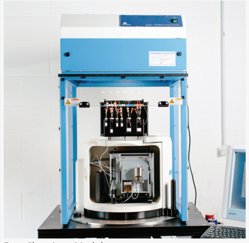
Best Chemistry Module

cyclotron manufacturing company based in North America producing cyclotrons of varying energies, ranging from 1 MeV to 400 MeV, to hospitals, industry and academic/research centers including for Medical Diagnostic and Therapeutic Applications. TBG's cyclotrons have been installed in thirty sites globally and continue to save lives, by producing radiopharmaceuticals for patients and research.