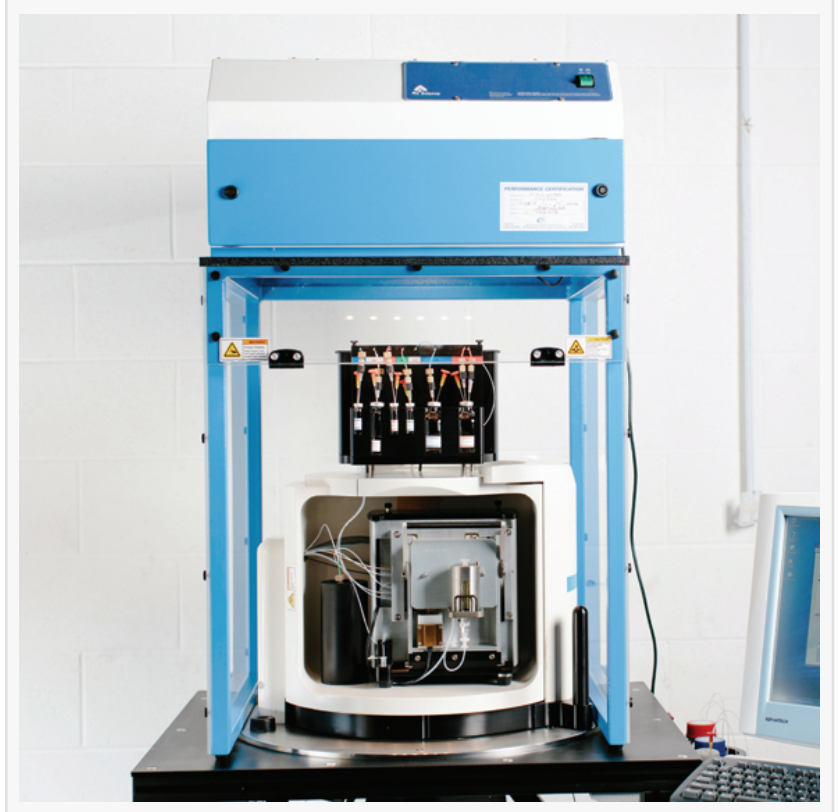
Best Chemistry Module

based in North America producing cyclotrons of varying energies, ranging from 1 MeV to 400 MeV, to hospitals, industry and academic/research centers including for Medical Diagnostic and Therapeutic Applications. TBG's cyclotrons have been installed in thirty sites globally and continue to save lives, by producing radiopharmaceuticals for patients and research.