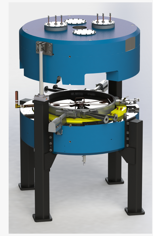
Best 6–15 MeV Compact Variable Energy Cyclotron System (Open View)

http://www.teambest.com/about bio.h tml.