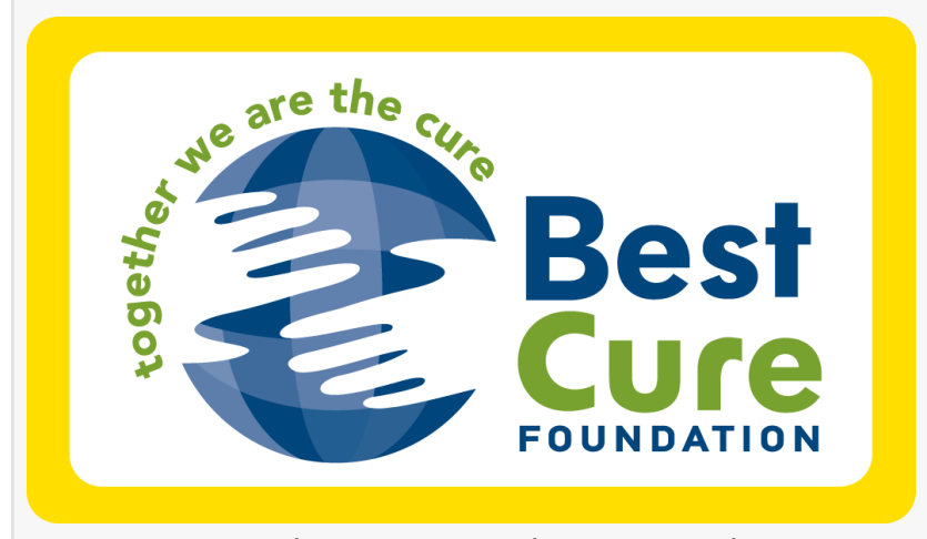
Best Cure Foundation — www.bestcure.md

For more information about the Best Model B35adp, other cyclotrons and products from <u>TeamBest Global Companies</u>, Best Cyclotron Systems, Best ABT Molecular Imaging and Best Cure Foundation, please visit: