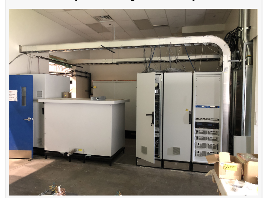
Best 70 MeV Cyclotron Cabinets

BTL had to use 1.35 Million USD of cash to secure this Performance Bond.