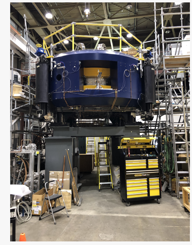
Best 70 MeV Cyclotron Magnet Assembly

This was to be Installed for the IBS — a new project of nearly one billion USD. I have visited IBS at least twice, and my team had visited IBS and PPS multiple times. IBS demanded that BTL post a Performance Bond for 10%. BTL posted a Cash Collateralized Performance Bond of 1.35 Million USD, as Canada's Export Development Corporation (EDC, who had lost 500 million USD by lending to a Colombian, S. American National who may have filed for bankruptcy, but will not support BTL in Ottawa, where the Canadian Government and EDC HQ are located, while BTL is the most sophisticated High-Tech Medical Company in Canada, and has been in existence for 70 years, saving millions of lives annually around the world) has not been supporting and providing the Insurance; therefore,